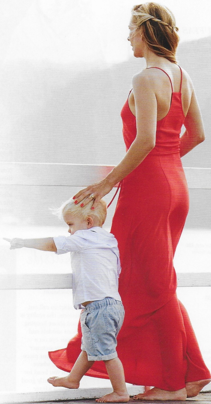
Pippa wears dress Camilla and Marc ; Astor wears shirt, shorts, both Seed Heritage Kids